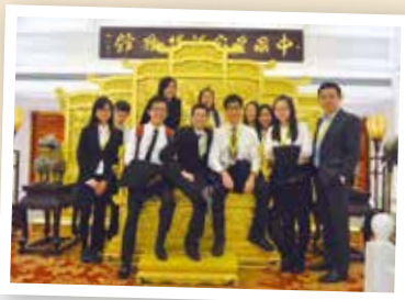
領袖生內地交流計劃