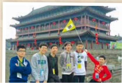
「千古·千尋」西安交流服務團