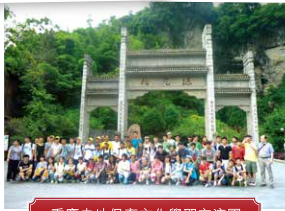
重慶史地保育文化學習交流團