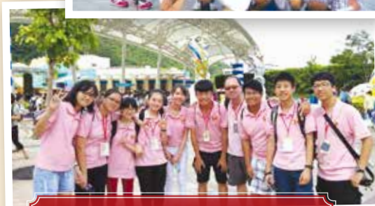
京港澳學生交流夏令營 2014