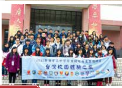
台灣校園體驗之旅