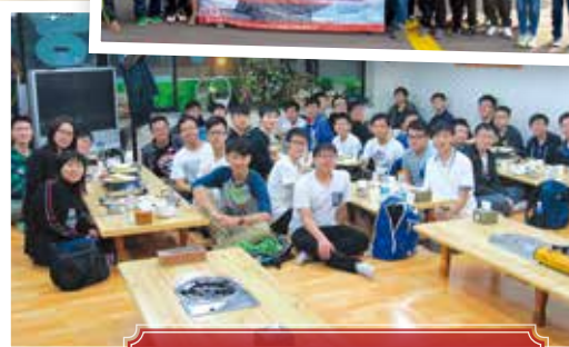
Cultural and Technology Study Tour in Seoul